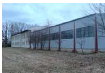
Hall of professional training and practice